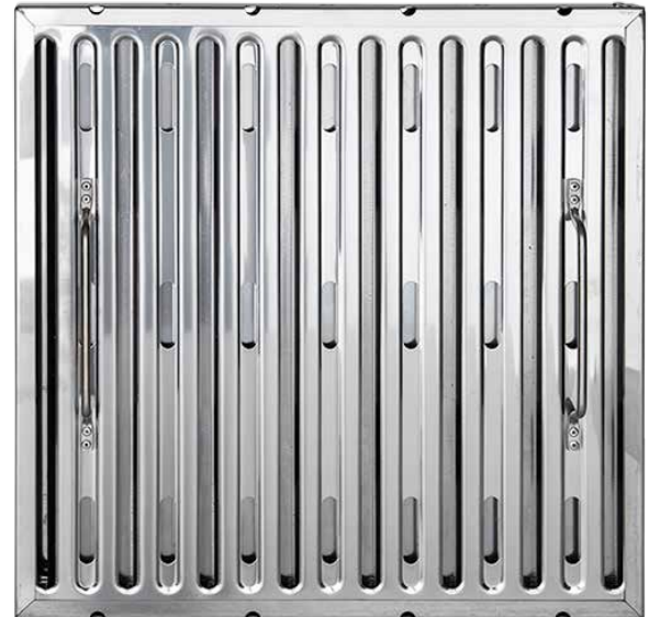
U.S. Patent 10,837,653