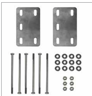
Top Mount Kit