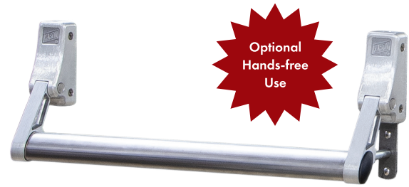
U.S. Patent 11,193,311